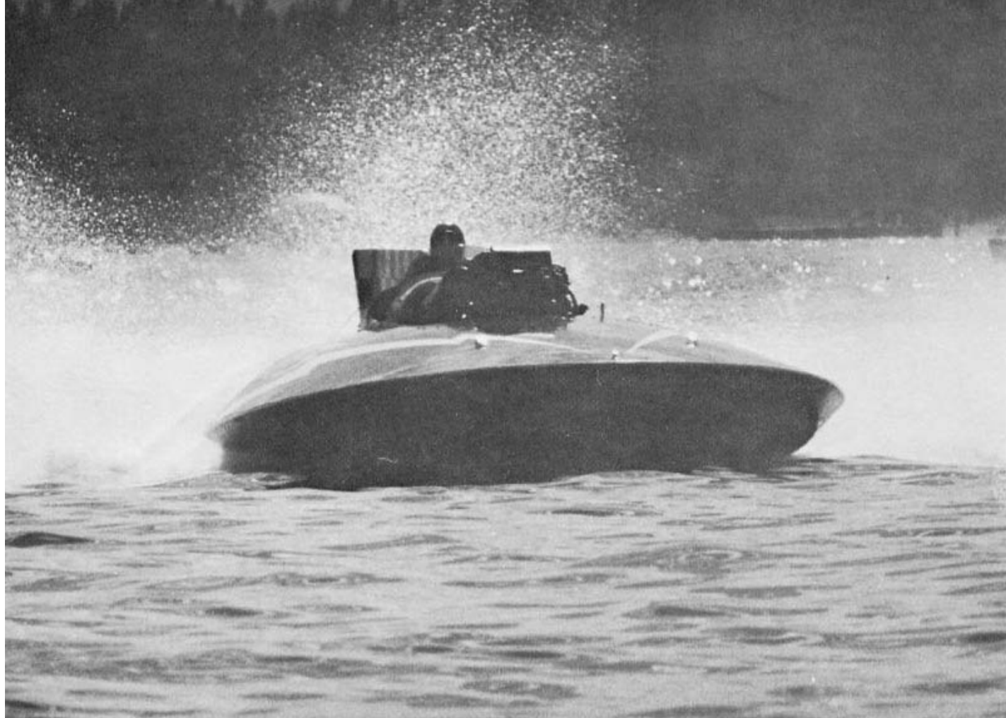
Here comes Miss Exide!