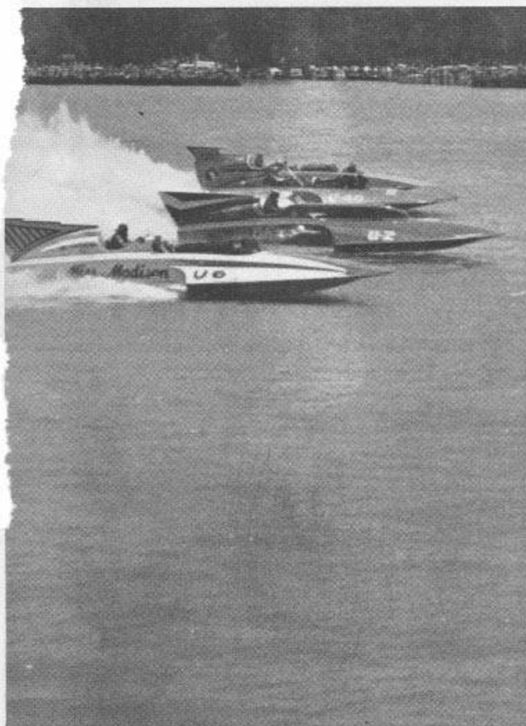
Winner of the Gold Cup was in doubt until the very end. Here (foreground to shoreline) Madison, U.S.V, Bardahl, and Tahoe begin their first heat and their seesaw duel for the hardware.

When the unlimited hydroplanes met back in July on the Detroit River to decide the 1964 American Power Boat Association Challenge (Gold) Cup, the prophets were out in force. A prediction of the outcome, amply supported by many plausible reasons, could be had from any stranger, and from the regular racing buffs without even asking.