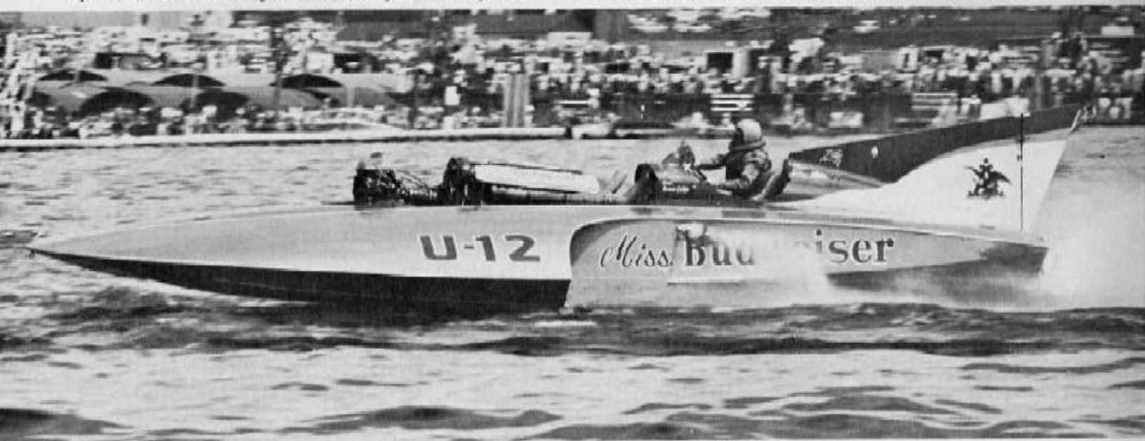
• Above: The Tahoe Regatta was a big one for Bardahl. It wrapped up the national high point title and won the Tahoe cup for the third consecutive time. Below: Budweiser took second place.

Mist and Exide through two laps. Exide and Savair's Mist exchanged places in lap three to establish final finishing order. Bardahl posted 105.840 mph to win.